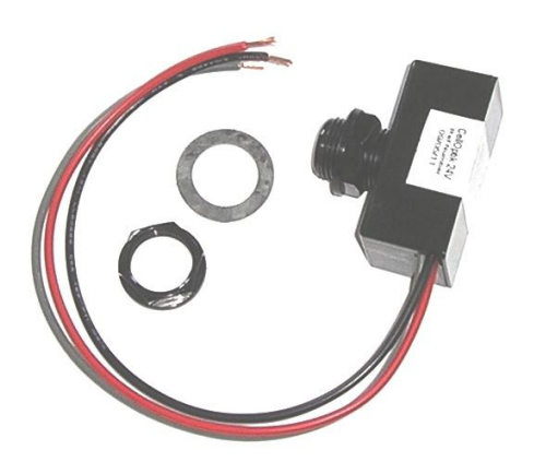
Energy Saving Dusk to Dawn Photocell Switch